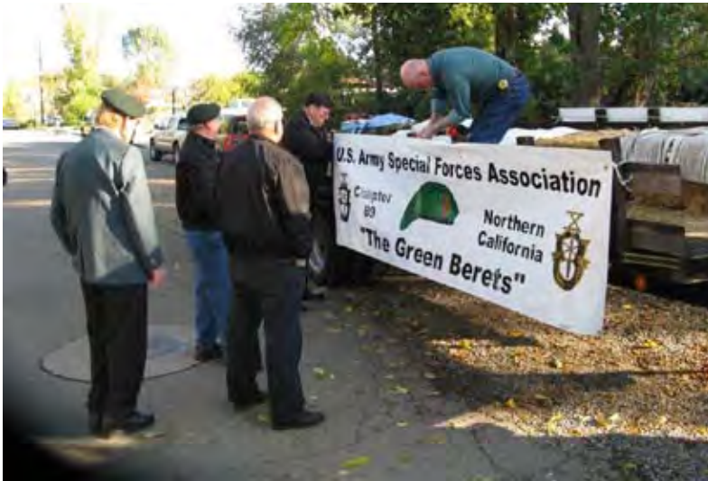
Pre-Parade preparation. Too many chiefs and not enough Indians!!