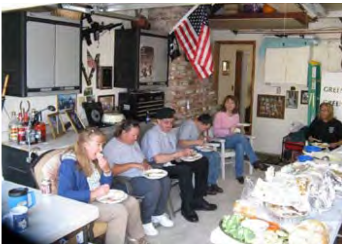
Post-Parade dining and camaraderie.