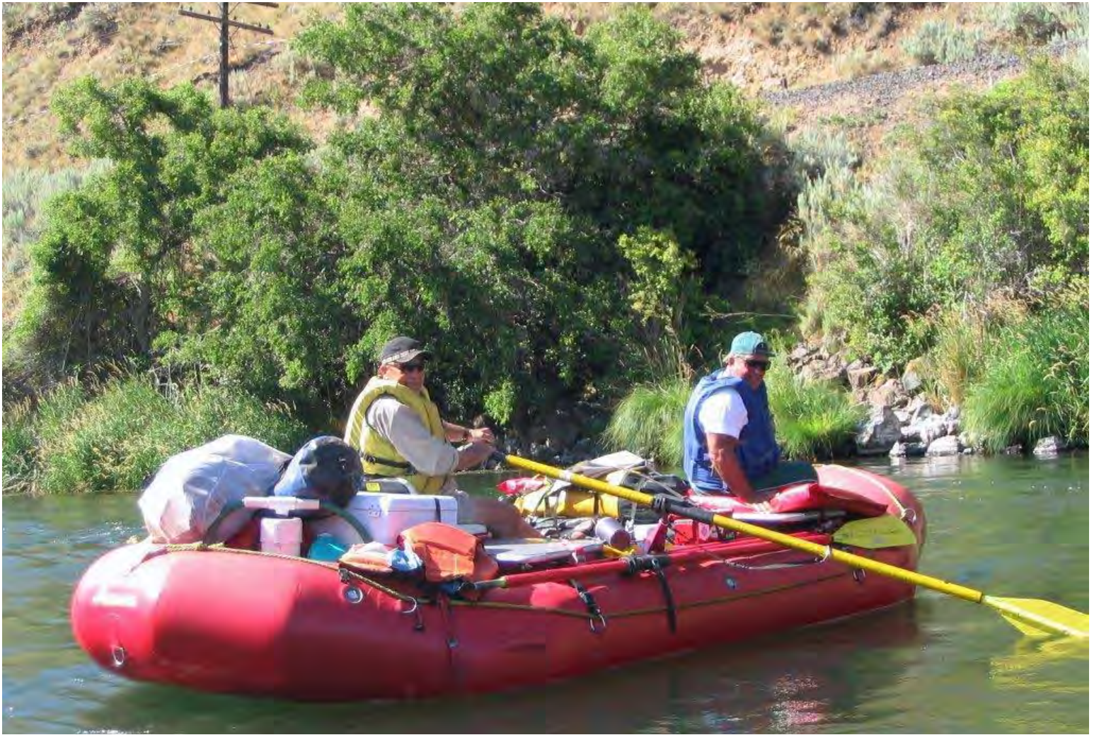
"Claymore" and "Golden Body" on the "Float and Bloat" river trip.