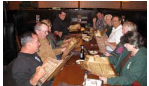
Still smiling and happy!!