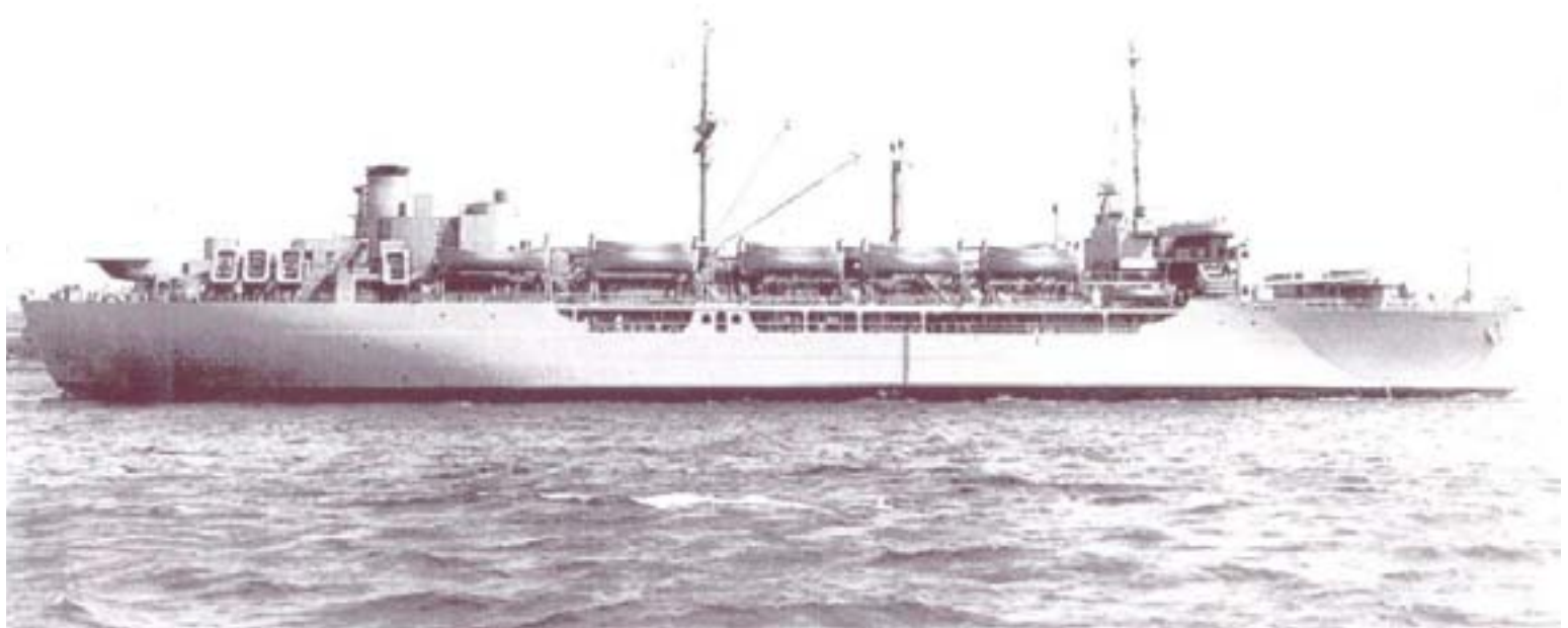
The USS Greely at Wilmington, NC (Oct '53) loading 10th SFG personnel for transport to Bad Toelz.