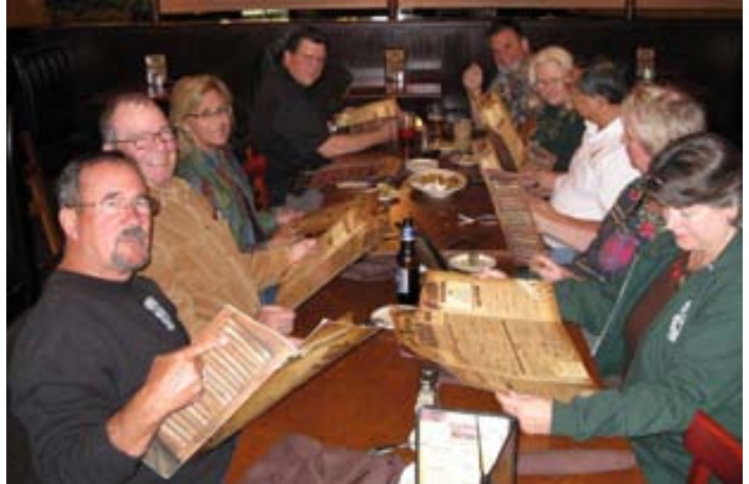
Post meeting 'fun & frolicking' at "Cool Hand Luke's" in Redding.

This Chapter is one of the busiest in the organization and one of the smallest. That is quite a distinction and it is all due to the high quality of its members. I know of much larger Chapters that have a much harder time getting members to participate in projects or even to attend meetings. That doesn't seem that unique until you realize that back east