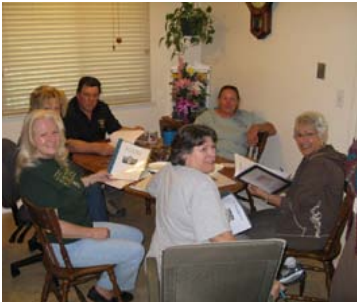
The Chapter scholarship committee in action selecting the recipients.