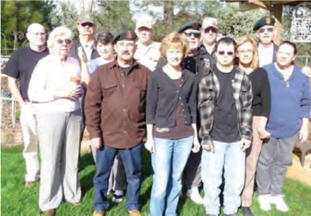
The "Gang"- February Chapter meeting.